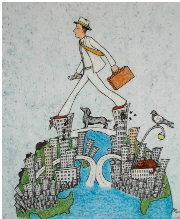
Figure 2. How the environment, animals and public health are interrelated.

During the first stage of urbanization, there were very few animal species in cities. The past few decades have seen what can only be termed a population boom of animals –not only pets in the traditional sense of the term, such as cats and dogs, but also aviary birds, aquarium fish, hamsters, etc., which are now also considered household pets to all intents and purposes. Over and above these pets, there is a wide range of synanthropic animals living in cities. Humans react to these synanthropic animals in completely contrasting ways. In some cases, humans react favorably, in some cases with indifference, with at the other end of the spectrum repulsion and at times even hatred (zoophobia).