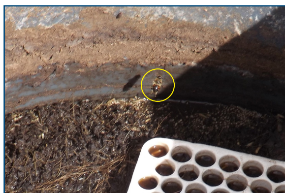
Figure 7. Drone fly ( Eristalis tenax ) evidenced by a yellow circle.

Water demand for internal temperature regulation becomes urgent when the outside temperature exceeds 30 °C (Lindauer 1954, Hegic and Bubalo 2007). In our experiment, despite the fact that during 28 days the maximum temperature exceeded 30 °C, bees did not harvest water from manure tanks. We believe that, although more distantly located, bees deliberately preferred a source of clean water. In turn, individuals of 'drone fly' were observed on