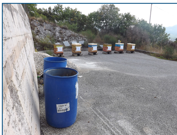
Figure 1. Position of beehives and tanks filled with manure.

A field study was carried out at the Istituto Zooprofilattico Sperimentale dell'Abruzzo e del Molise 'G. Caporale' (IZSAM), in the courtyard of the District laboratory of Isernia, Molise region, Southern Italy (41.58417° N, 14.20019° E) from August 1 st to October 3 rd 2013. The experiment involved 6 hives (Dadant-Blatt composed of 10 honeycombs) of Apis mellifera ligustica , placed in a single row, 1 metre away from each other. Hives were labelled as follows: A1, B1, C1, A2, B2, and C2. Colonies were homogeneous in terms of strength according to the method described by Accorti (Accorti 1985) and Marchetti (Marchetti 1985); bees covered each of the 10 combs and had an efficient queen, born in June 2013. The bees were not suffering from any overt diseases, and the parental apiary had never been treated with antibiotics. On August 1 st , 2 tanks filled with 200 L each of pig manure were located 6 metres away from the hives (Figure 1). Three foamy plates were placed on the free surface