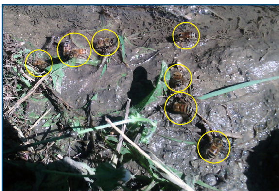
Figure 4. Foraging bees (evidenced by yellow circles) on puddles of clean water.

The mean minimum temperature recorded in August was 17.8 °C, the average maximum temperature was 32.4 °C, the average medium temperature was 24.3 °C. Six rainy days with 32.0 mm of rain fell were recorded. In September, the mean minimum temperature recorded was 14.2 °C, the average maximum temperature was 28.3 °C, and the average medium temperature was 20.0 °C. Nine rainy days were recorded, with 77.4 mm of rain fell (Figure 5).