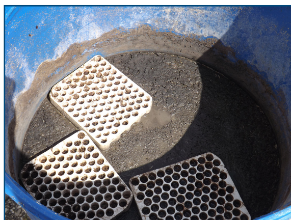
Figure 2. Foamy plates placed on the free surface of tanks in order to assist bees for water supply.

Once a week during a 3-week period, hives belonging to groups B (B1, B2) and C (C1, C2) were fed with 1 L of an aqueous solution of sucrose (sugar syrup) 50% w/v. Once a week for 3 weeks, the sugar syrup of group C was added with 200 mg of oxytetracycline, following guidelines given by