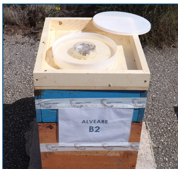
Figure 3. Feeders placed on hives of group B.