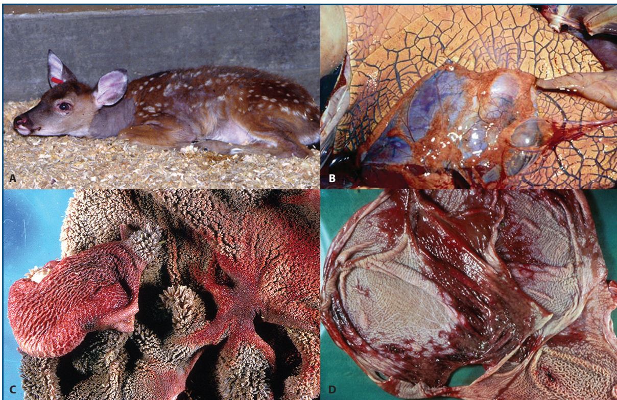
Figure 2. Clinical outcomes in white-tailed deer infected with epizootic haemorrhagic disease virus. A. Animals rapidly lose weight and condition within days of infection. This animal on day 4 post infection is in poor body condition with a rough hair coat. Note hyperaemia around the eyes. B. Disease may be peracute with death within 4 days of infection, usually as a result of severe pulmonary oedema. C. Animals that survive longer develop the more typical acute form of disease characterized by severe haemorrhage as seen in the forestomachs of this white-tailed deer on day 8 post infection. D. Vascular damage results in ulceration of the oral cavity and gastrointestinal tract in the subacute form of the disease.

More recently, attempts have been made to elucidate the response of specific types of monocytic cells, i.e. dendritic cells, to infection. Bluetongue virus has been shown to replicate in and activate conventional DCs (cDCs) and plasmacytoid DCs (pDCs) in vitro releasing proinflammatory molecules, such as IL 1, 6 and 12 (Hemati et al. 2009, Ruscanu et al. 2012) At the same time, genome-wide expression profiling (Ruscanu et al. 2013) has been used to demonstrate that in sheep BTV infection modifies