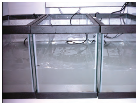
Figure 4 Toxicity assay with suspended solids

Each test was conducted with two different concentrations of solids; three replications were performed for each concentration on 10 molluscs in each case (Fig. 4) (8). A control without the addition of granules was set up for all tests.