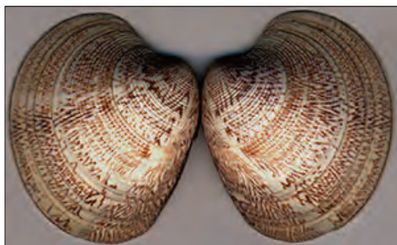
Figure 1 Chamelea gallina

A cause-effect relationship between increased solids in suspension and the mortality of C. gallina was postulated in the report on the monitoring programme of the Agenzia Regionale per la Prevenzione e Protezione Ambientale del Veneto (ARPAV: Veneto Regional Environmental Prevention and Protection Agency), following numerous deaths of bivalve molluscs. This phenomenon, which has particularly affected clams, occurred in Veneto in November 2004, in the area of coastline which runs from the River Tagliamento to the River Sile. The report recorded that the molluscs sampled after the deaths revealed the presence of large amounts of sediment that had a fine particle size and that the chemical, microbiological and ecotoxicological tests conducted on water samples did not detect any abnormalities (1).