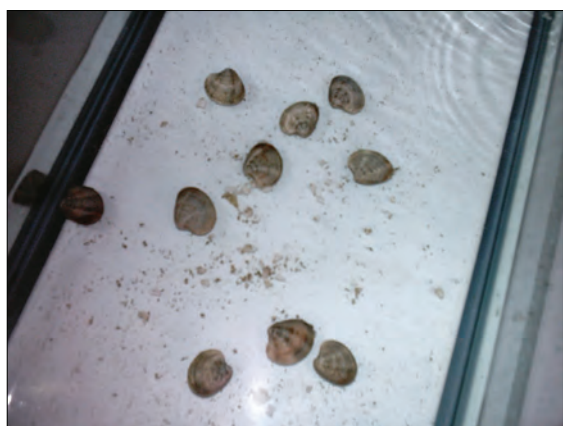
Figure 3 Adaptation phase of Chamelea gallina

During the adaptation period (7-14 September 2005 for test I, 27 October to 3 November 2005 for test II and 10-17 November 2005 for test III), the organisms were fed with D. tertiolecta on the first and fourth days only (8). During this phase, the molluscs proved able to feed normally on the seaweed suspension.